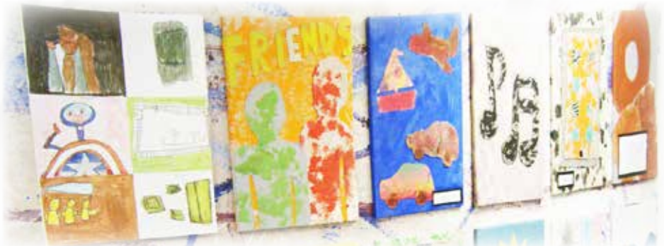
Artwork by Derbyshire schoolchildren

AJM Healthcare is currently working with different groups and schools to create community projects. This provides an alternative route of expression and helps us to connect with the community.